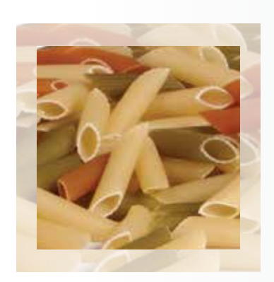
PENNE RIGATE MIX VEGETABLES (TRICOLOR)