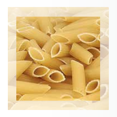
PENNE RIGATE متاخي منب