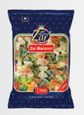
FARFALLE MIX VEGET ABLES (TRICOLOR) فراشه الخضروات الملونه (الالوان الثلاثه)