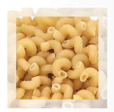
CAVATAPPI کاوا تابی