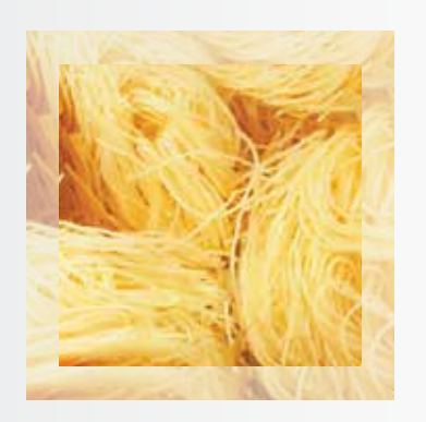
NEST ANGEL HAIR شنحاا میبحش 1701