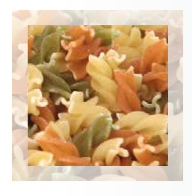
FUSILLI MIX VEGETABLES (TRICOLOR) فوسيلى الخضروات الملونه (الالوان الثلاثم)