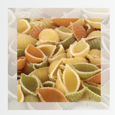
SHELLS MIX VEGETABLES (TRICOLOR) قفيغه الخضروات الملونه (الالوان الثلاثه)