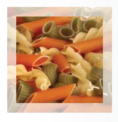
MIX MIX VEGETABLES (TRICOLOR) میکس