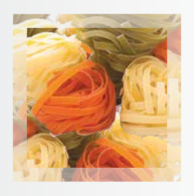
NEST FETTUCCINE MIX VEGETABLES (TRICOLOR) فتوشيني الخضروات

فتوشيني الخضروات الملونه (الالوان الثلاثه)